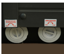
XL External drain for quick drainage