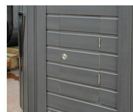
Topside is hid behind door, only key-holder has access.