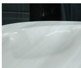
Integrated headrest Durable