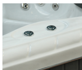
Easy controls, Simple and efficient.