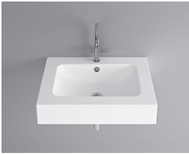
Design: Tesseraux + Partner