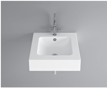
Design: Tesseraux + Partner