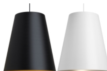
Black / Satin Gold