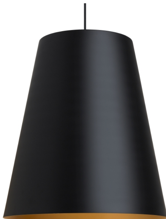
Black / Satin Gold

Rated for (1) 150 watt max E26 medium base lamp (Lamp Not Included). LED version includes 120 volt 12 watt, 650 delivered lumen, 3000K, medium base LED G40 lamp. Dimmable with most LED compatible ELV and TRIAC dimmers. Fixture provided with twelve feet of field-cuttable cable.