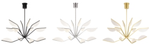
Matte Black Satin Nickel Natural Brass