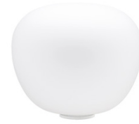
Table lamp with diffuser in satin-finish white blown glass. Supporting structure made of metal or polyester reinforced with glass fibre, painted white.