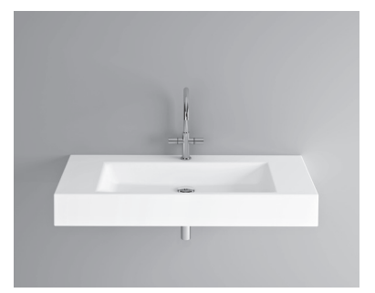
Design: schmiddem design