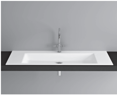
Design: schmidem design