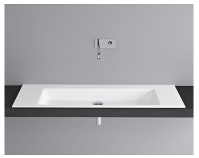
Design: schmiddem design