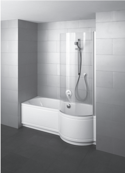
Design: sieger design