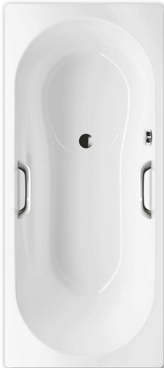
Similar illustration Right hand model shown