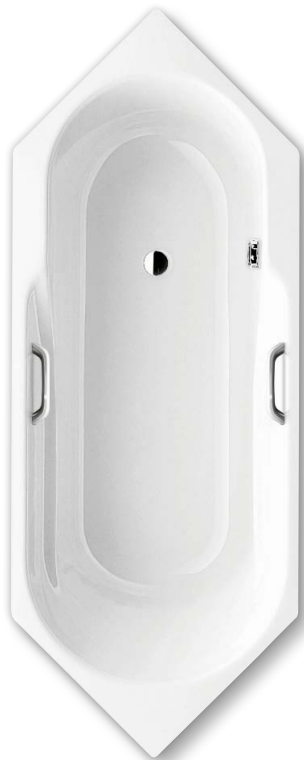
Similar illustration Right hand model shown