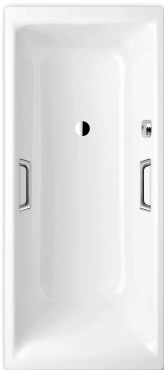
Similar illustration Right hand model shown